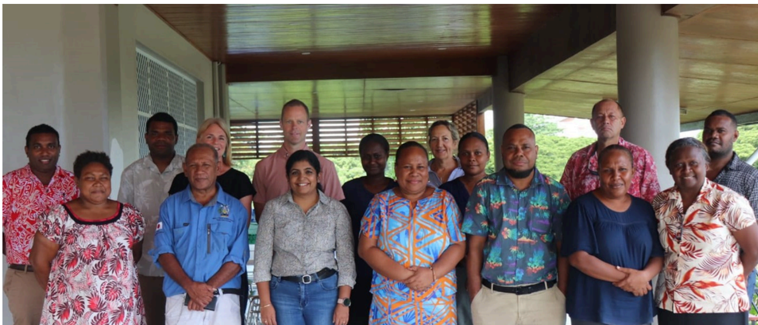
Workshop facilitators and participants

SINU remains committed to strengthening research and innovation in the fisheries sector and looks forward to contributing valuable insights and expertise to the Fish Innovation 2 project.