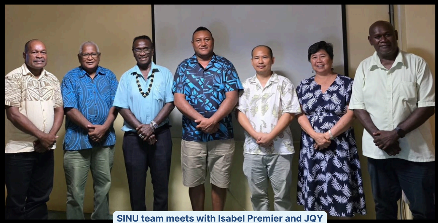
SINU team meets with Isabel Premier and JQY