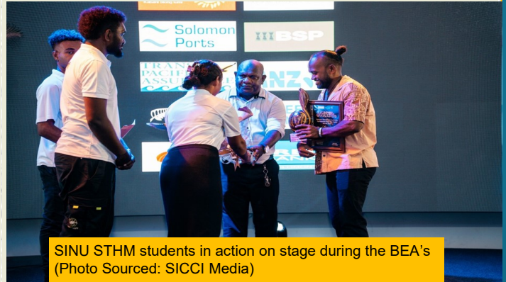
SINU STHM students in action on stage during the BEA's

formative experience that enhanced their skills and confidence. Event attendees, SICCI staff, sponsors, and collaborators also provided positive feedback, highlighting the students' professionalism and commitment throughout the event.