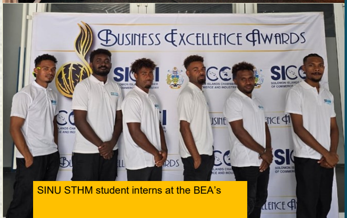
SINU STHM student interns at the BEA's

industry connections that will empower them in their future careers," he added.