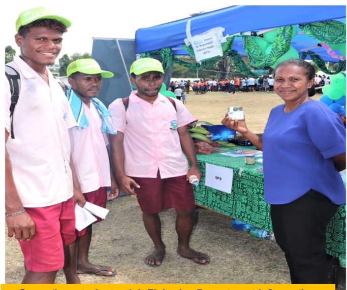
Secondary students visit Fisheries Department Information Booth during the 2024 Open Day.