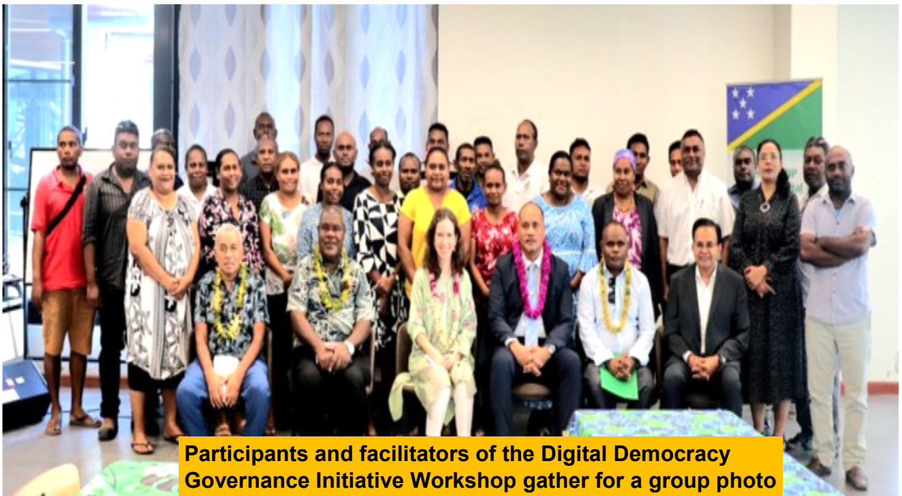
Participants and facilitators of the Digital Democracy Governance Initiative Workshop gather for a group photo

It offers a platform for sharing regional and global best practices, aiming to enhance digital governance and create value for society. By fostering collaboration and promoting innovation, the workshop aims to establish a supportive environment for digital governance in the Solomon Islands, laying a strong foundation for future initiatives and advancing digital democracy across the Pacific.