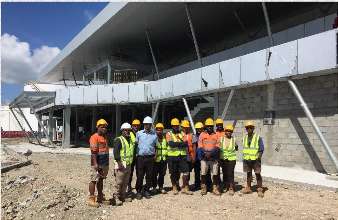
The Diploma of Construction Management students on the Domestic Terminal Construction site

The subcontracting and labour relation parts of the unit are also on full display in the management, supervision and coordination of works