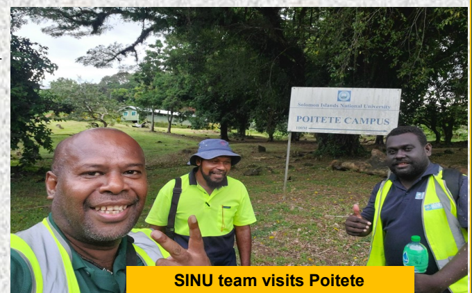
SINU team visits Poitete

The process to secure the funding commenced in July 2022, with a visit from the Indian High Commissioner and his team to SINU.