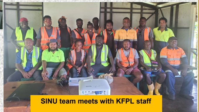
SINU team meets with KFPL staff

Due to threats during the ethnic tension period, the campus suspended its training, relocating its certificate program to the Kukum Campus until 2018, when a review reduced the certificate program to one year.