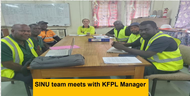
SINU team meets with KFPL Manager