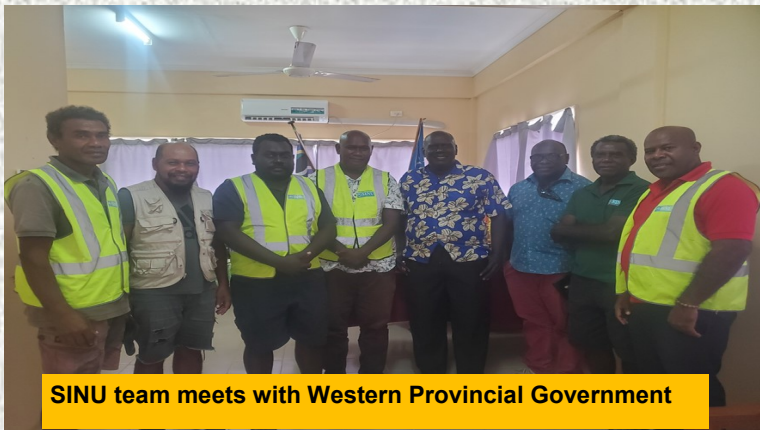
SINU team meets with Western Provincial Government

For the land trade-off, SINU would engage with relevant government bodies, it was revealed.