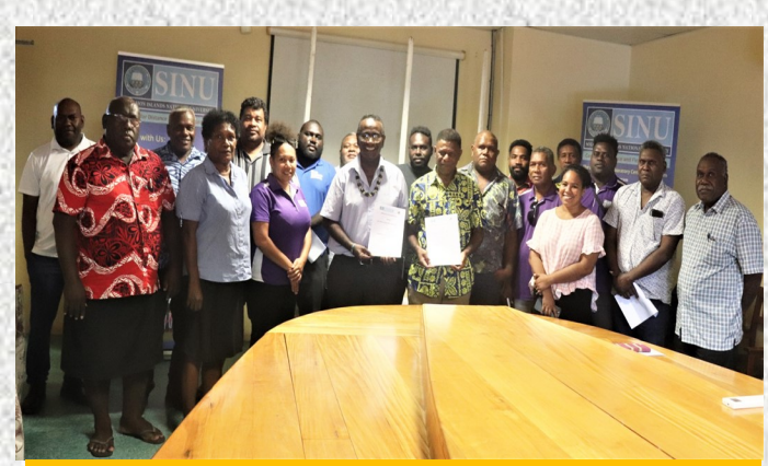
SINU staff members and delegation from ECGC posed for a group photo with the signed MOU

"These facilities will serve as a central hub for our distance learning initiatives, providing students with access to the technology and resources necessary for their studies."