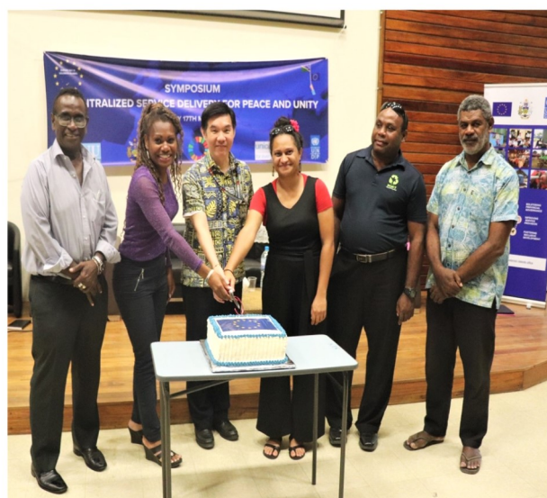
Panellists cut a cake to mark the European Union Day symposium.

With that, the SINU VC said the issue of decentralization and empowerment of communities has many dimensions to it where he said as a university SINU has a responsibility and a role to play