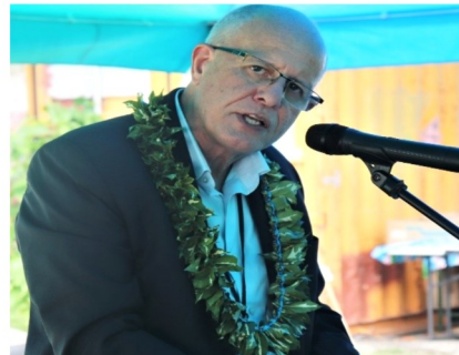
New Zealand High Commissioner to Solomon Islands Jonathan Schwass delivers his speech.

“This MOU gives way for MFMR to have access to the site and to do minor renovation fit for purpose which will allow MFMR to comply with protocols and regulations of importing the GIFT into Solomon Islands.”