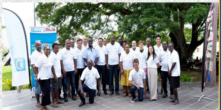
Participants pose for a group photo with the Vice-Chancellor of SINU at the FALAH Workshop on 14 May 2024

The workshop concluded with fruitful discussions, leaving participants equipped with insights to apply in their respective fields.