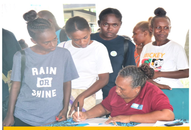
Students queuing up to vote