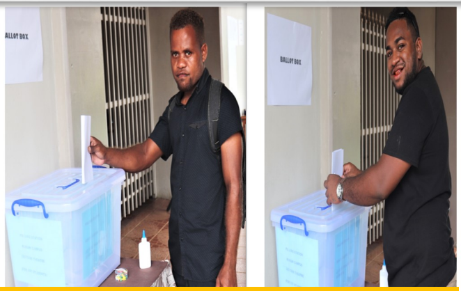
Two students cast their votes at the Kukum Lecture Theatre.